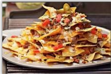
Southwestern Nachos w/seasoned pork & corn bean salsa