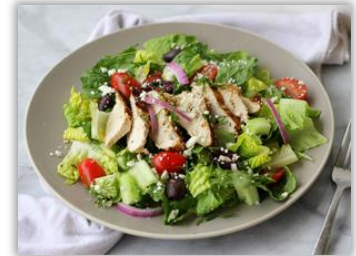
Grilled Chicken Salad w/ cranberries & almonds