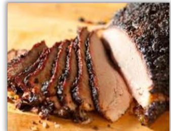
LEC Famous Sliced Beef Brisket Sandwich

Thanks for your support of the Lancaster Event Center, a 501(c)(3) non-profit organization dedicated to growing community through events like yours, including the Lancaster County Super Fair.