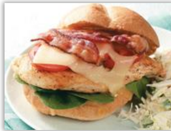
Grilled Chicken BLT