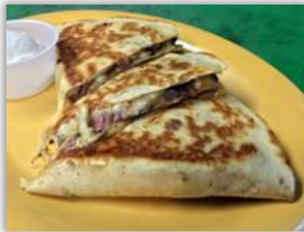
Beef Brisket Quesadilla